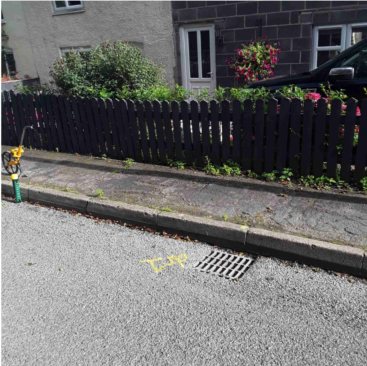
Photo from tablet device on site where flooding was reported on 17 th August and a job was issued on 19 th August to carry out jetting, investigation and any required civil works for repairs from gully to outfall to two gulleys. Note that water had subsided but officer determined there is still an issue.

Balfour Beatty's emergency crews are also equipped with tablet devices, so they are being instructed to capture photos of flooding when they arrive on site as they are often some of the first responders to emergency flooding events. This information can then be shared with the Floods and Water Management team as it may be useful to establish if properties were flooded and aid in section 19 investigations.