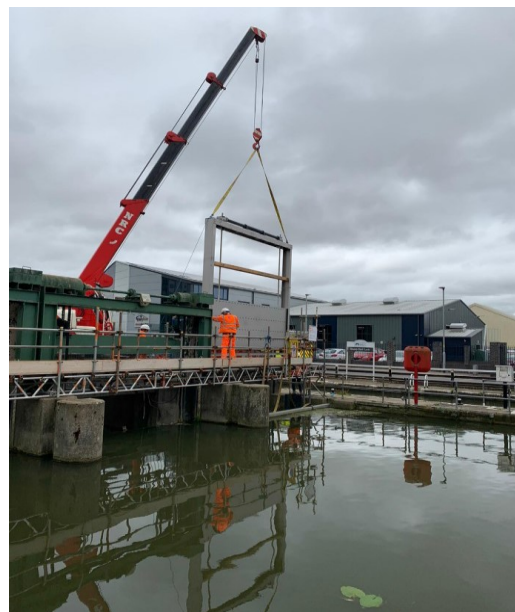
Figure 3: Lincoln Defences Works