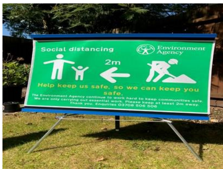
Figure 1: Environment Agency's social distancing signage