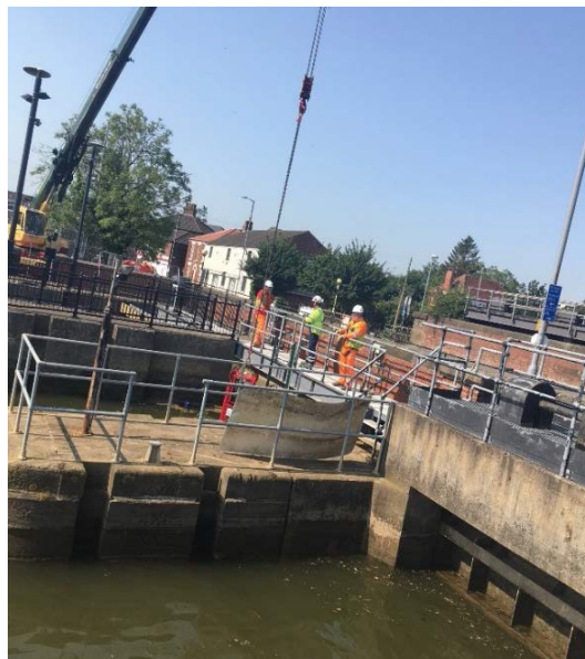
Figure 2: Black Sluice